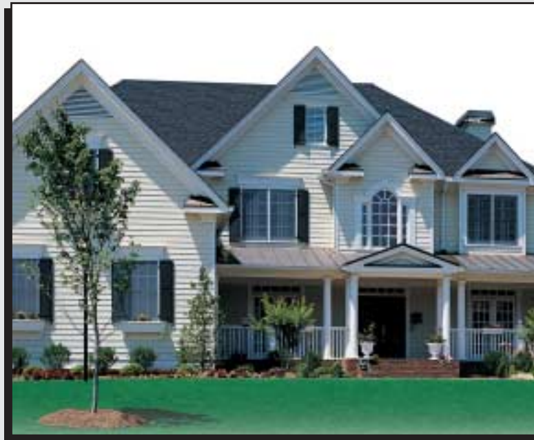
The beauty and texture of wood—but better!

Cemplank ® Lap Siding Cempanel ® Vertical Siding Cemtrim ® Boards